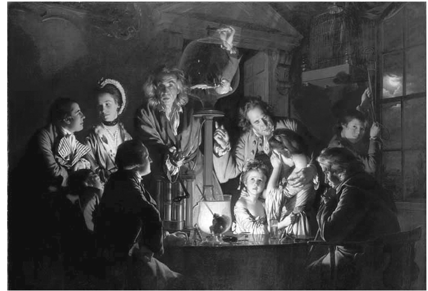
An Experiment on a Bird in the Air Pump , by Joseph Wright. (National Gallery, London.)

The adult facing us in the painting is a traveling science lecturer, if you will, a circuit rider of the new religion, demonstrating a vacuum pump to the rapt onlookers. He is pumping the air out of a glass cage, and to make that fact visible there is a bird inside the cage. By watching the bird gasp for breath, in other words, they can see that there’s no more air in the cage, and be impressed with what technology can do. But what other impression are we to receive? The real dramatic interest in the painting, what grabs our eyes and holds them, is the children. For them this is not about the wonders of science. In their innocence they do not follow the explanation of the pump and the air; they just think a man is killing a little bird. The real story of the painting is in the contrast between the glazed lecturer holding the audience spellbound, a kind of high priest of technology, and the distress of the children—and the fact that they are children, and the adults just ignore them. When we hurt nature, it is not that we lack warnings. Not all of us lose our sensitivity at once. The real tragedy is to ignore those who are still aware of what we’re doing—the way, in the Iliad , Hector and his wife, Andromache, laugh at their little son,